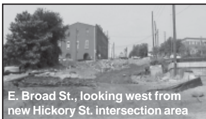
E. Broad St., looking west from new Hickory St. intersection area